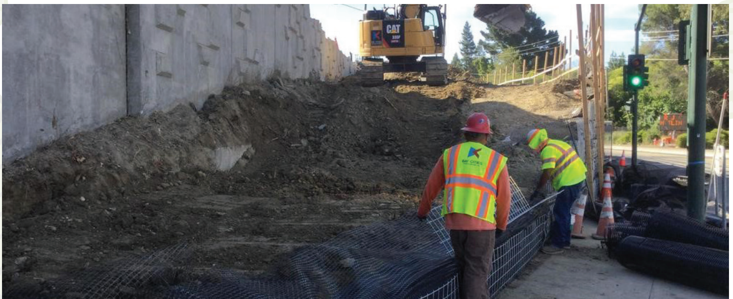
Construction of the temporary embankment at South Main Street

Additionally, the SB I-680 on-ramp from South Main Street will be closed for approximately a few weeks during mid-2020. More details on this extended closure will be provided in an upcoming update.