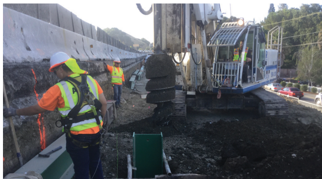
Shoring installation for Retaining Wall No. 4 on SB I-680 between the South Main Street Undercrossing and Rudgear Road

The project entails I-680 freeway widening work in the southbound direction between North Main Street in Walnut Creek to just South of Rudgear Road in Walnut Creek to accommodate the completion of the high-occupancy vehicle (HOV)/carpool lane, which will be converted to an express lane. Additionally, the project will convert eight miles of an existing southbound HOV/carpool lane to an express lane between Marina Vista Avenue in Martinez and North Main Street in Walnut Creek. To accommodate freeway widening work, tree removal took place during the Winter of 2018, utility relocation took place in the Spring of 2018, and soundwall removal and construction began in Spring of 2019. When construction is complete, there will be 24 miles of continuous southbound express lane between the Benicia-Martinez Bridge toll plaza and the Alameda County line.